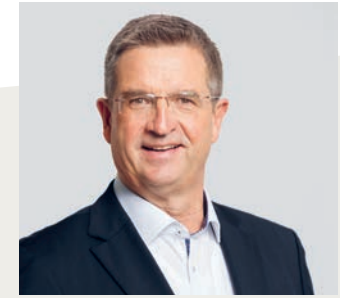
Oliver Zipse Chairman of the Board of Management of BMW AG