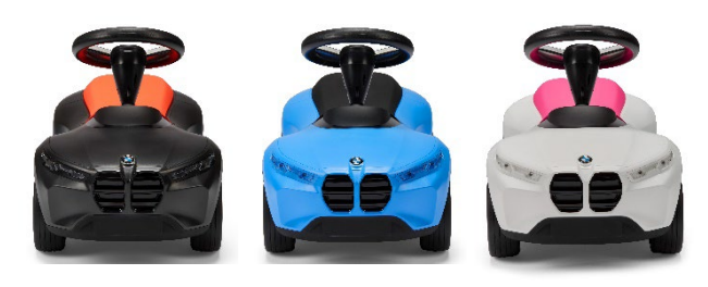
BMW Baby Racer IV