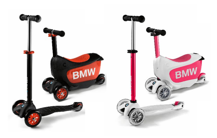
BMW Kids Scooter