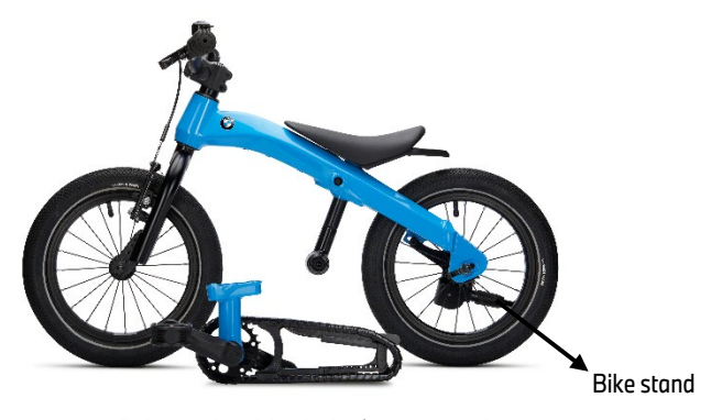
Drive unit with chain for conversion