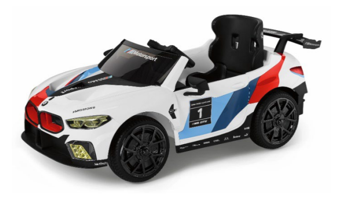
BMW M8 GTE Ride On 12V