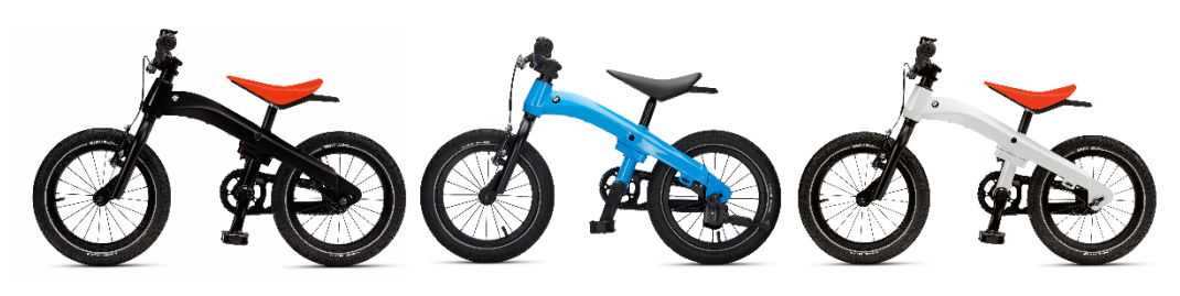
BMW Kids Bike 14"