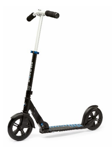
BMW City Scooter